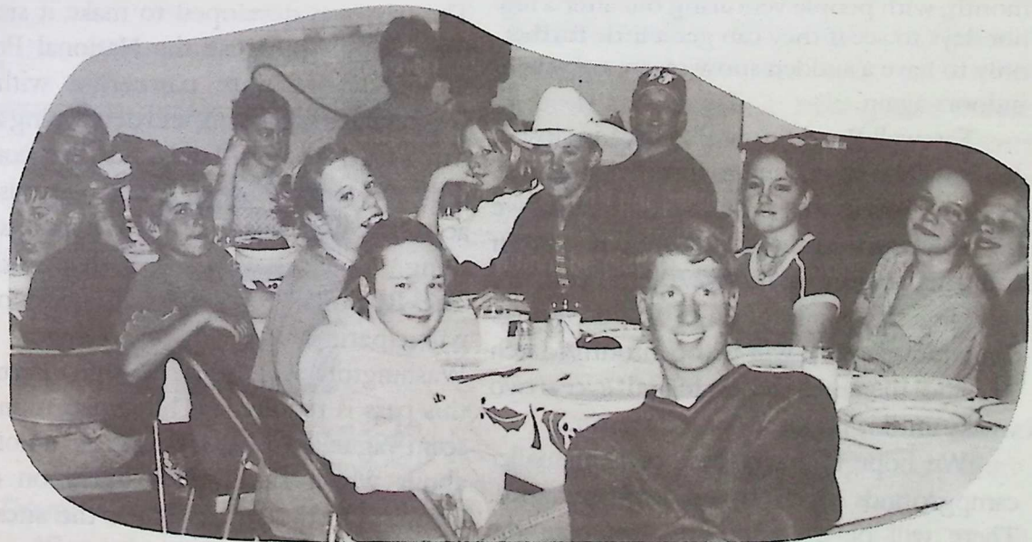
FOOD AT LAST!!! Turkey dinner with all the trimmings, mmmm. It's been 30 hours since food!!!