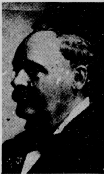
Candidate for Nomination for

Justice of the Peace East Portland District