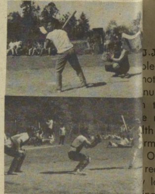
ACTION around home plate. Shots of both teams at bat.

EL fuerte "Casey" llegó a batear! Entonces lo dieron 3 "strikes!"