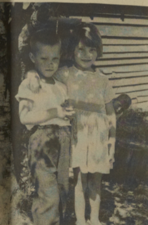
There's double trouble or double fun - depending on how you look at it - at the Hammer camp in Stayton.