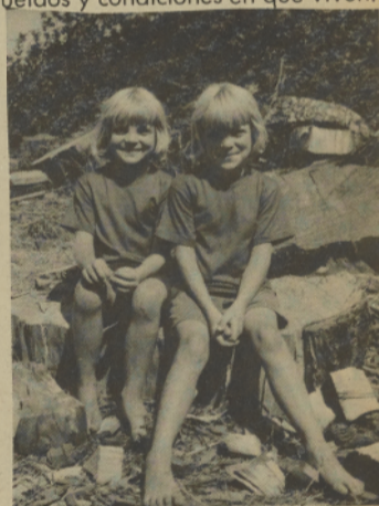
Quando hay problemas son dobles, y cuando hay diversión es doble en el campo de Hammer en West Stayton.