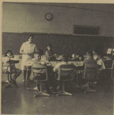
"We are learning to read and write at Waconda summer school."