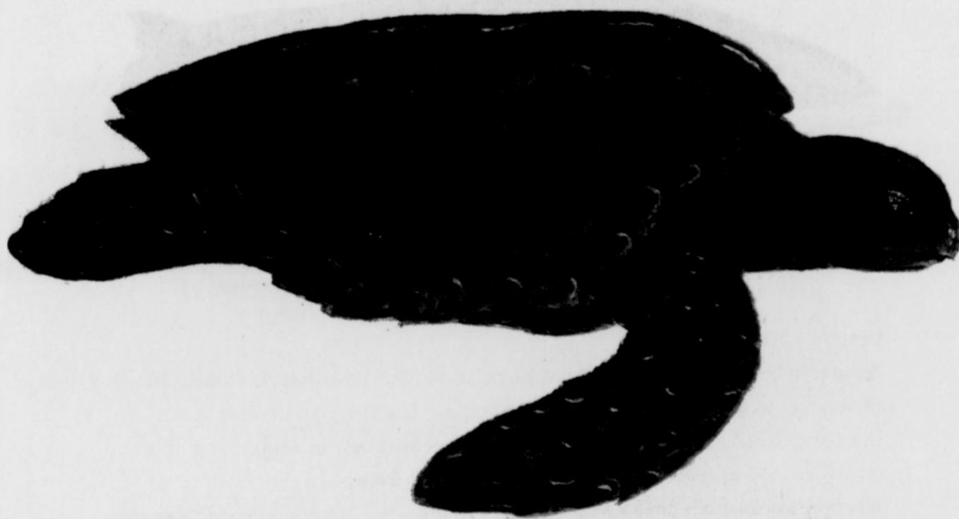
OLIVE RIDLEY SEA TURTLE ( LEPIDOCHELYS oliacea )

The Loggerhead Sea Turtle can become acclimated to a range of temperatures.