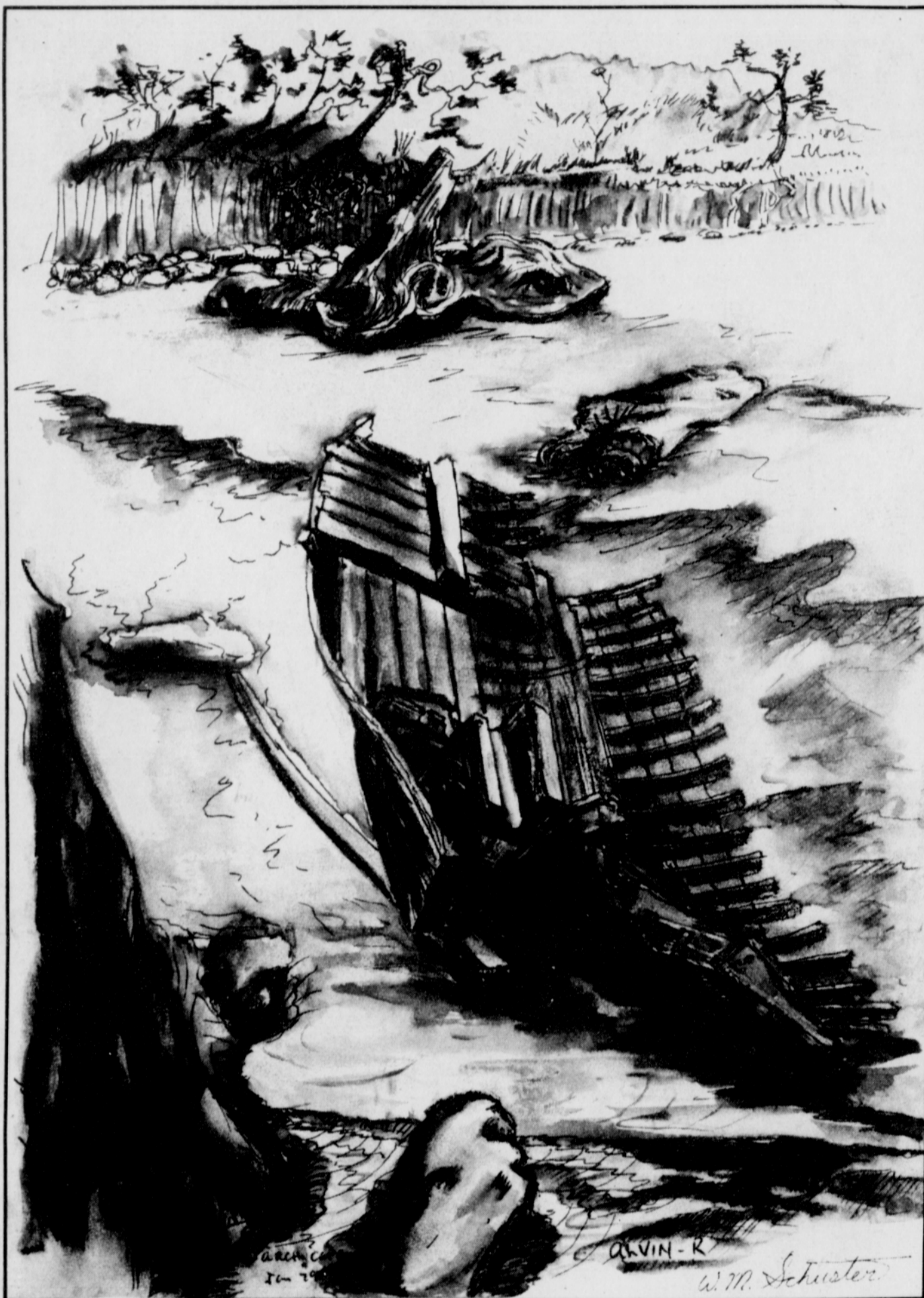
Wreck of the 'Alvin R'