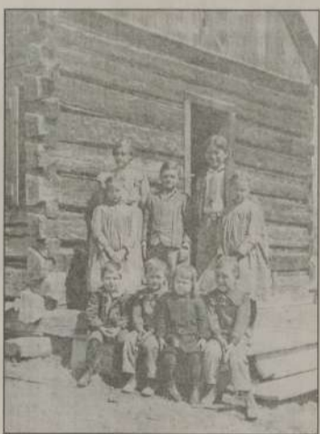
District 32 - Stewart School

a simple log cabin, hewn with a broad ax. Cracks were filled with V shaped poles and mud where necessary. Where the joints were close, mud alone did the job. It had a platform for the teacher's desk, a wide board nailed to the wall served as student desks. It had a slate (chalkboard) and slate pencils, benches without backs, and the cast-iron stove crouched in the center of the room.