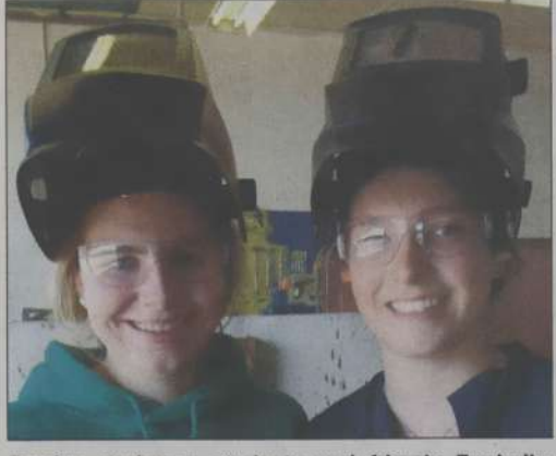
were introduced to welding this week.