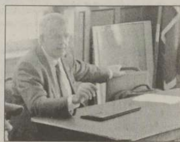
Cliff Bentz gives his Legislative Update

Oregon has a savings account, and there is actually money in it! Bentz reported that if the State doesn't suffer another recession, then the almost one billion dollars in Oregon's savings for 2015 - 2017 will grow to close