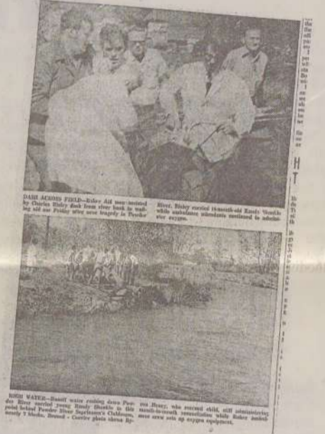
CHILDREN GATHERED - Baker City First Aid men rushed to the scene with oxygen equipment. Immediately the aid men set up their equipment and took over from Henry and then the team immediately began as they used one bottle of oxygen and switched to another before signs of life reappeared.