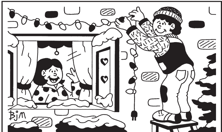
www.comparrotpuzzles.com