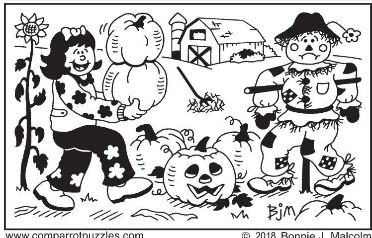
www.comparrotpuzzles.com