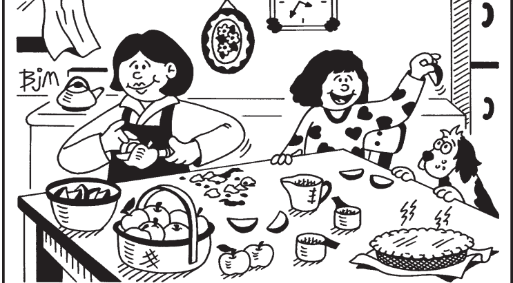
Solution: 1. Back of girl's chair is hidden. 2. Leaf on apple is missing. 3. Apple slice on table is missing. 4. Chair post is colored in. 5. Pattern on girl's shirt has moved. 6. Dog's paw has moved. 7. Handle on cupboard door has moved. 8. Handle on measuring cup has moved. 9. Lad's shirt collar is different. 10. Basket handle is different. 11. Window sill is lower. 12. Time on clock is different.