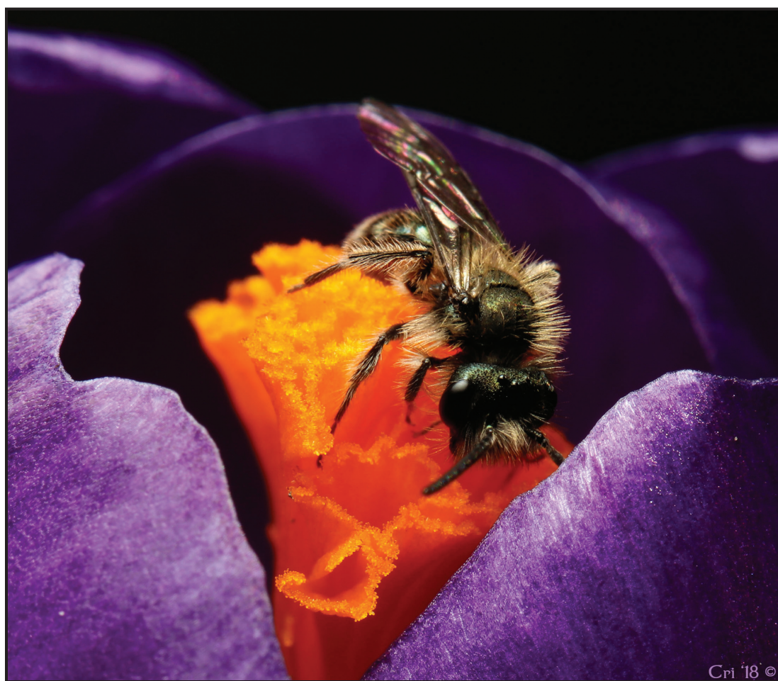
Cr1 '18 ©

Crocuses prefer full sun but will do well in a partially shaded area. Because they are small, you can tuck them in just about anywhere. You can put them at the front of flowerbeds (remember, they are short), in cracks between rocks or pathway stones, or just dotted throughout your yard. Crocuses are not fussy plants and will do well just about anywhere - in any type of soil. When you notice their blooming slowing (or stopping), it is because the bulbs have become too clustered. There is a quick fix for this: once blooming is done for the year and before the leaves die back (so you know where they are), dig the cluster up, divide the bulbs into small clusters and replant in the same area with at least 6 inches in between. Then, the following spring you will once again have a garden filled with color, pollinators and history.