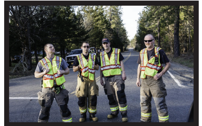
Four of our fabulous volunteers!!!

VISIT IVFD ONLINE AT ivfire.com or facebook.com/ivfire