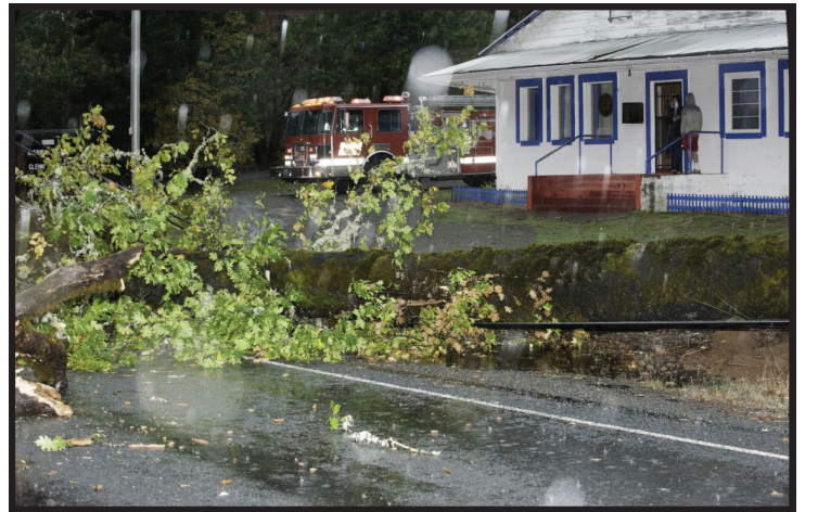
Tree across Caves highway over the weekend.

With this wet weather and breezy days, watch for falling trees and high water!!