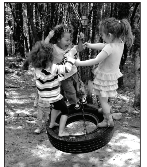
Preschool students enjoy the tire swing

Thank you so much to everyone who helped make the 2015-16 Dome School year a big success: our students and families, teachers and administrators, cooks, janitors, classroom and event volunteers, building expansion committee (it's happening!), and everyone who attended any of our events or donated time or money. Thanks!!