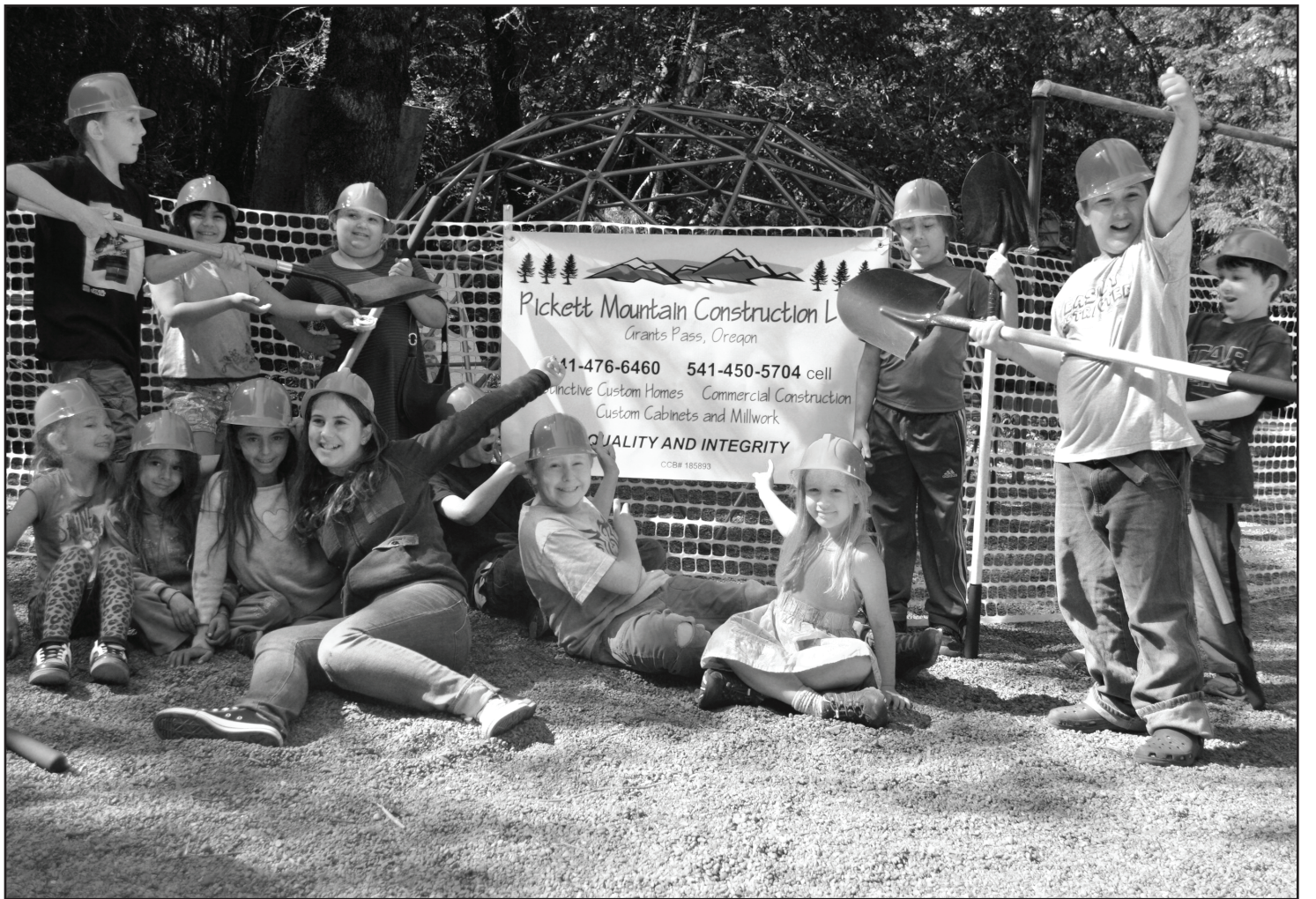
Following the groundbreaking ceremony, students pose by the only dome at the Dome School. And that fence may look grey, but trust us, it's definitely orange (the true mark that construction has begun).

To watch a short video about the need for the project, including some historic pictures and stories, please visit http://domeschool.org/help .