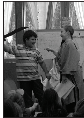
Two students duel it out during a performance of Shakespeare's "The Tempest," at last month's Open House.