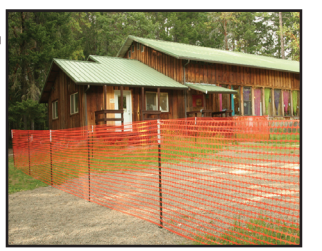
Why the long fence? Story, page 2

Volume 1, Number 1 - Published twice yearly since today