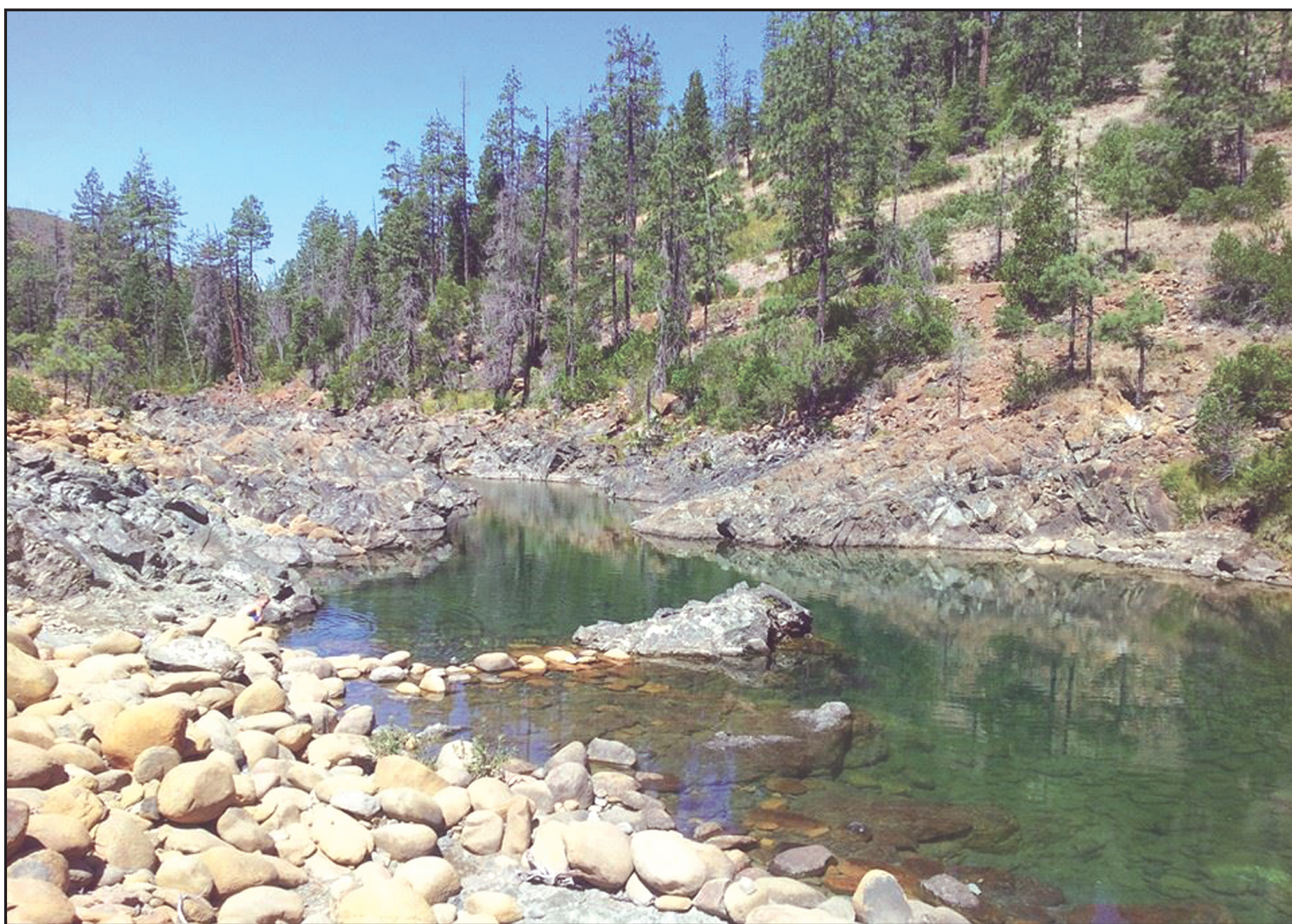
This special swimming hole (like many others in the Valley) tends to get slimy in the late summer, as the temperatures rise and the water levels drop, making the algae increase.