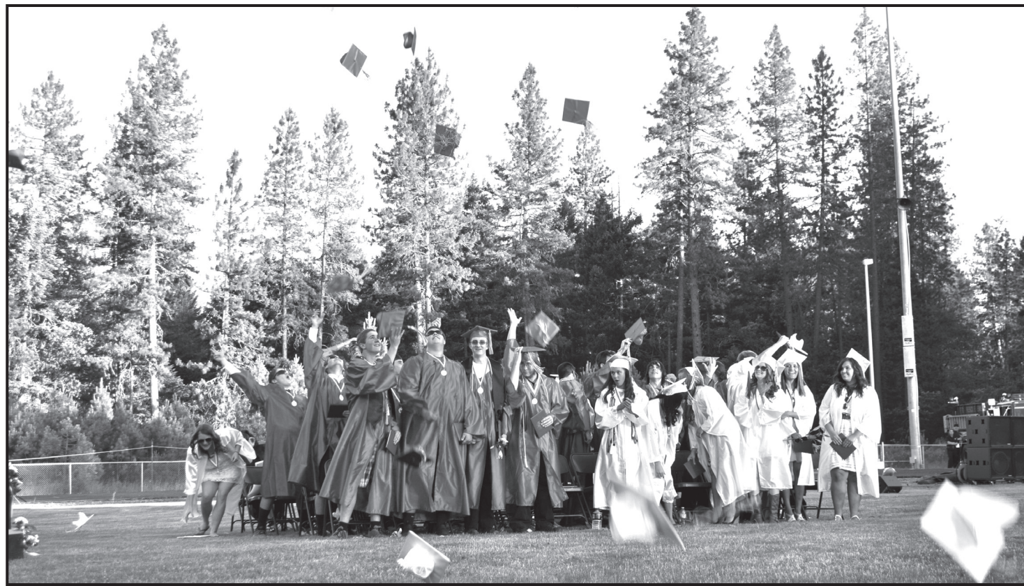
Members of the IVHS class of 2014 celebrated June 4, 2014