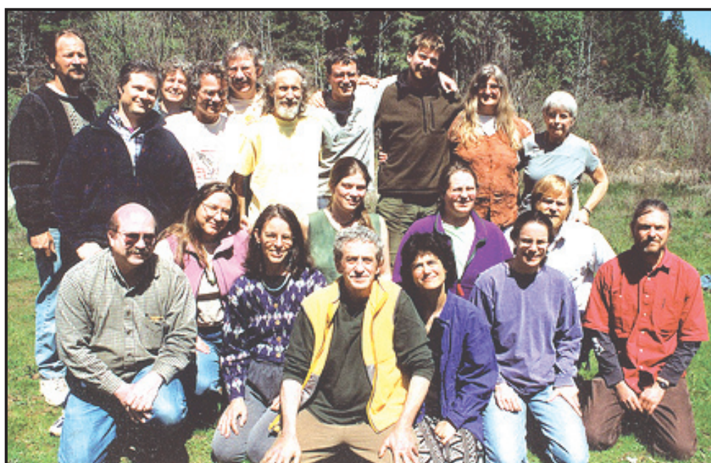
Staff and Board of the Siskiyou Project in 2001