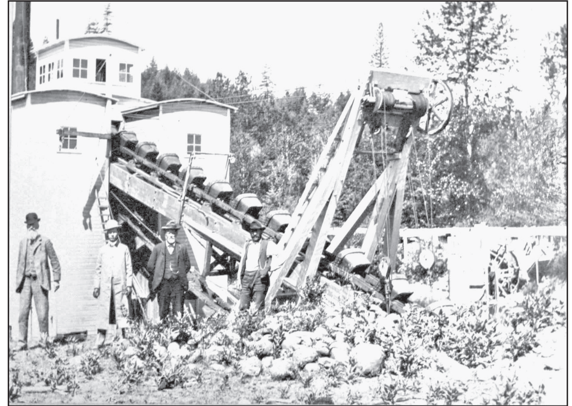
A group of men stand in front of a dredge with a design similar to the Josephine. The equipment in the background and clean buckets hint that the dredge may have been under construction.