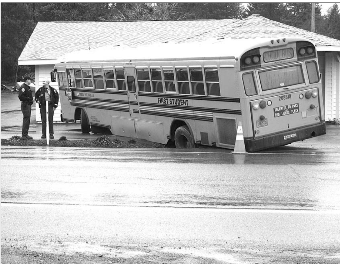
A school bus veered into a ditch before 3 p.m. on Thursday, Jan. 7 in the 500 block of Caves Hwy. No injury or property damage was reported. The bus sustained minor damage, and students were transferred to another bus. Josephine County Sheriff's Office responded to the scene and Illinois Valley Fire District personnel assisted with traffic control as the bus was towed out of the ditch.