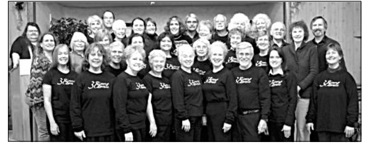
on the program.