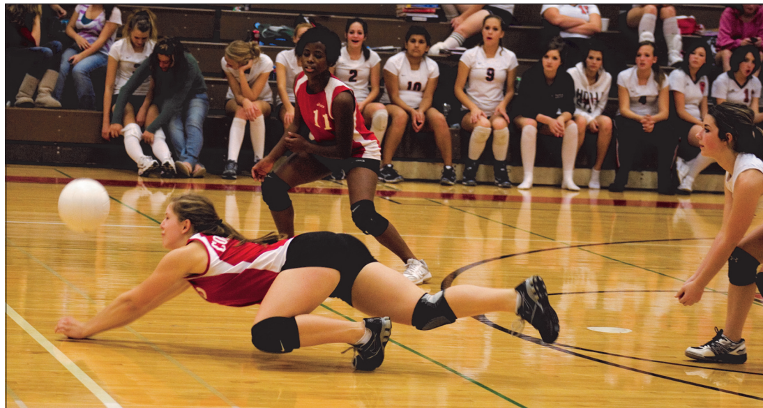
The Cougars (above) demonstrated grit and determination against the Pirates on Thursday, Oct. 15. The girls regroup (bottom photo) prior to going into overtime against the Phoenix Pirates.