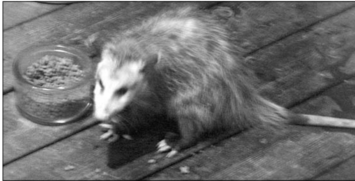
Pixie O'Possum, a nocturnal visitor

No, I'm referring to actual nonhuman critters including opossums, raccoons and an occasional skunk. Not to mention various jays, crows, and tweety birds. And let us not forget the stray cats, some of whom are stray only in the sense that they come to eat at our house instead of at their own home.