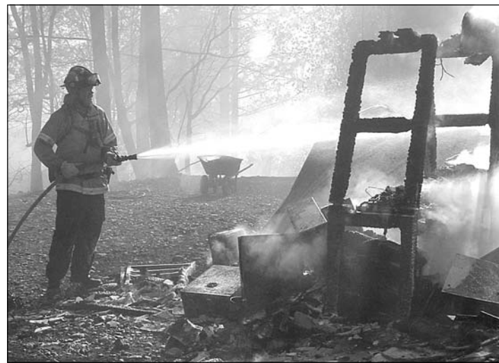
A firefighter mops up hot spots.