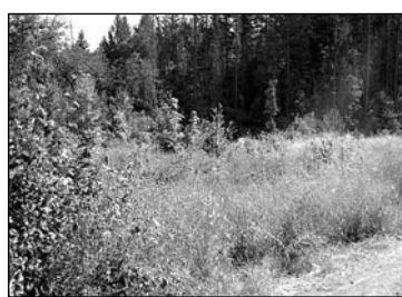
Weedy and overgrown (inset) city property on S. Old Stage Road is being treated by FAC.