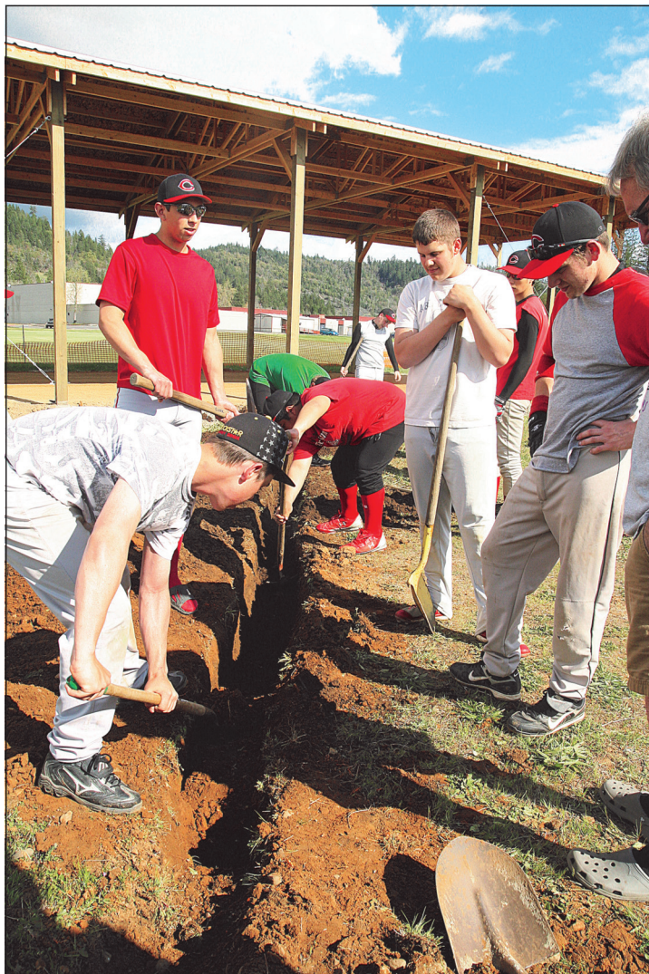
The Cougar boys baseball team contributed to the completion of a new batting cage by digging a trench for utility lines on Friday, April 17. The boys were supposed to play Gold Beach on Thursday, April 16, but no umpires were scheduled, and the game was called off at the last minute. The Cougars will play at North Valley High School on Saturday, April 25.