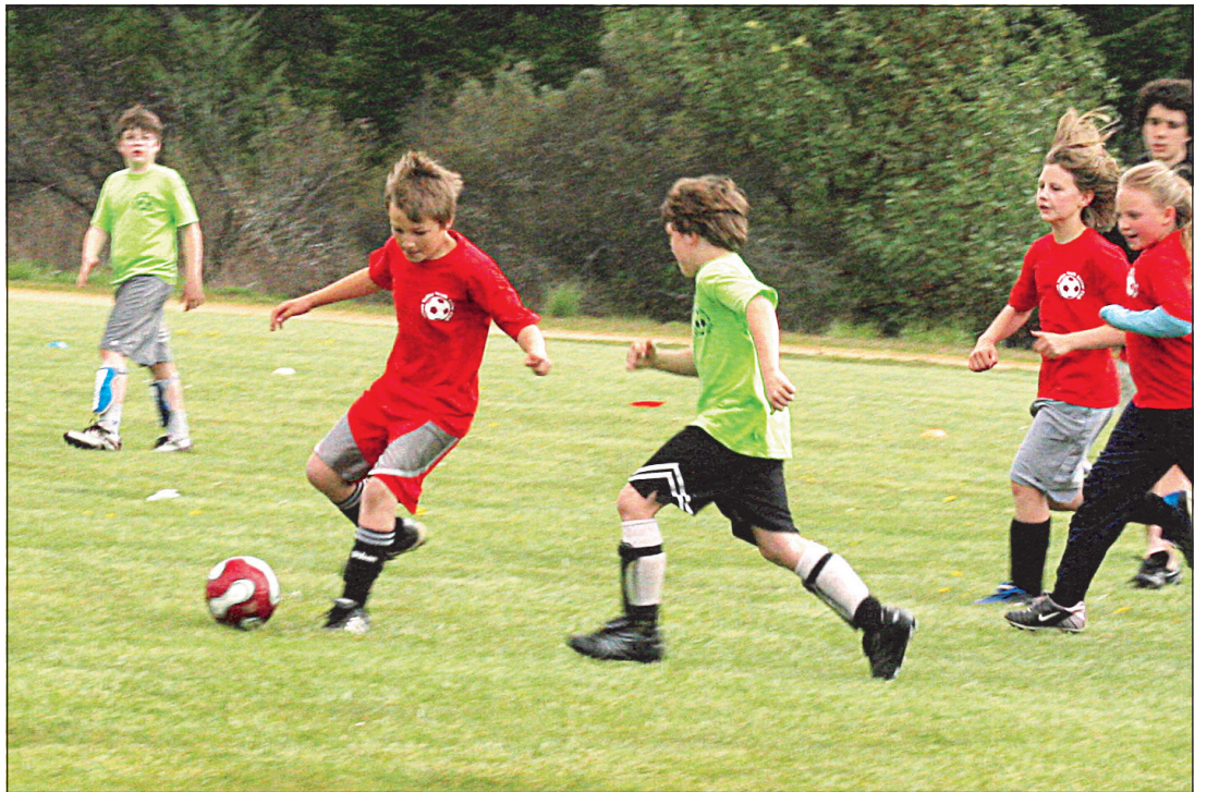
Illinois Valley Youth Soccer spring season is under way. Teams play on the athletic field at