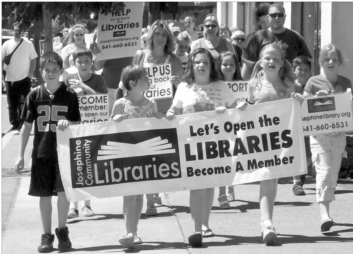
A five-week membership drive for Josephine Community Libraries Inc. (JCLI) was kicked off Saturday, May 17 with a march in Downtown Grants Pass. The move to reopen and operate county