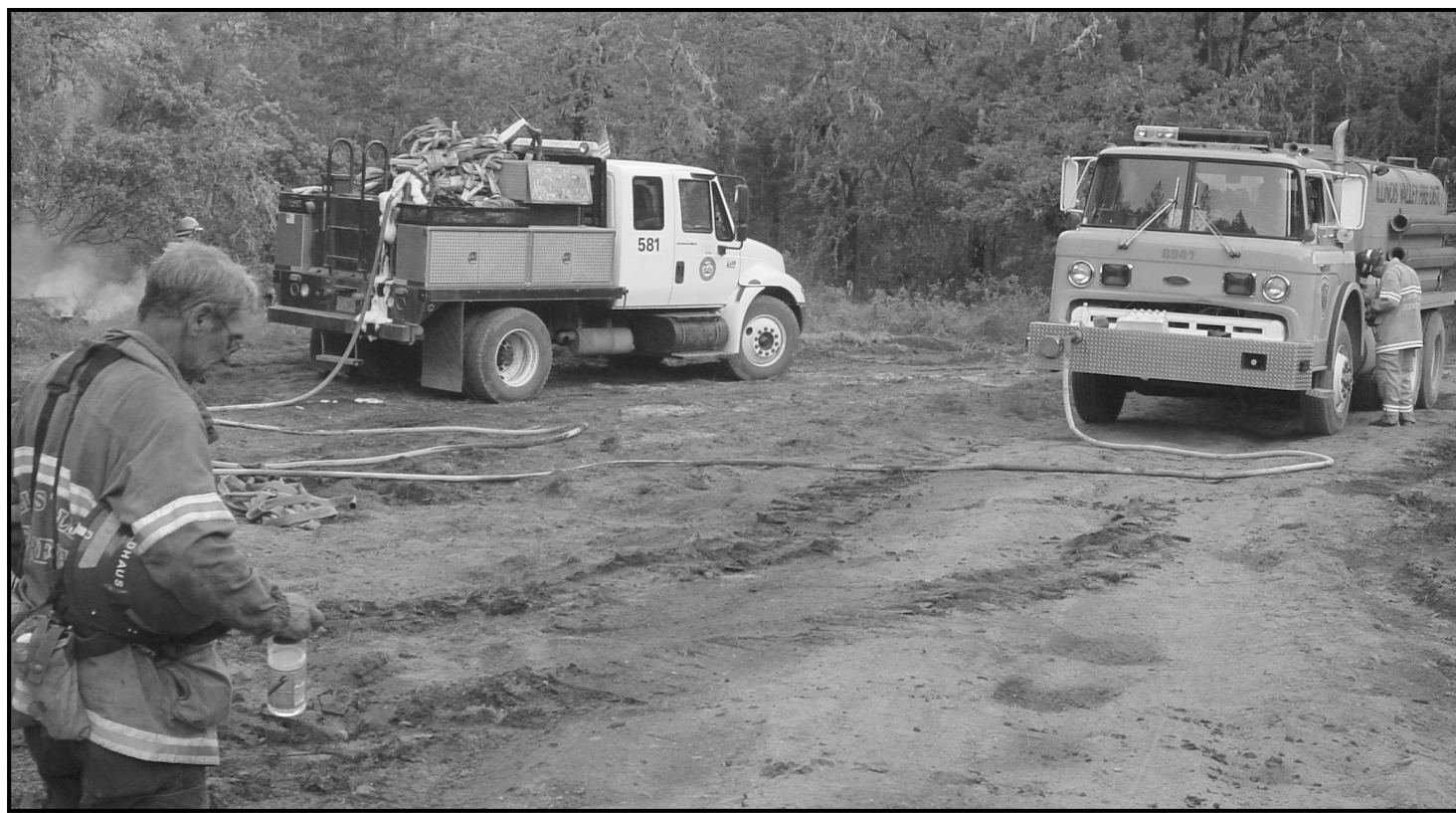
Several wildfires have kept area firefighters busy of late. Some 5.5 acres of wildland were burned out Indian Creek Road (photo) Thursday, May 15. Illinois Valley Fire District (IVFD) and Oregon Dept. of Forestry (ODF) responded. On Sunday, May 18, IVFD extinguished a .25-acre fire on Naue Way. The same day, a

"We want get people excited about the fact that in this valley we produce this fabulous fiber," she said.