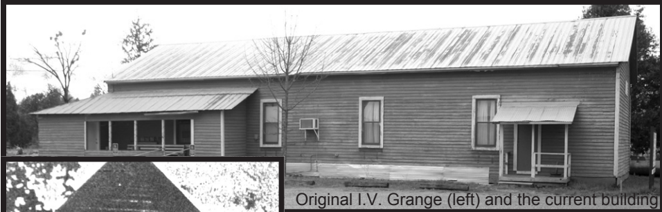
Original I.V. Grange (left) and the current building