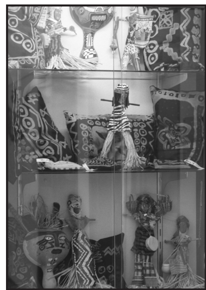
Student art on display

LTA conducted two-day workshops in conjunction with the school's Africa studies program. On Wednesday and Thursday, May 14 and 15, directed by coordinator Noralene Harland, African arts were presented to the students in the forms of mud-cloth and adinkra textiles,