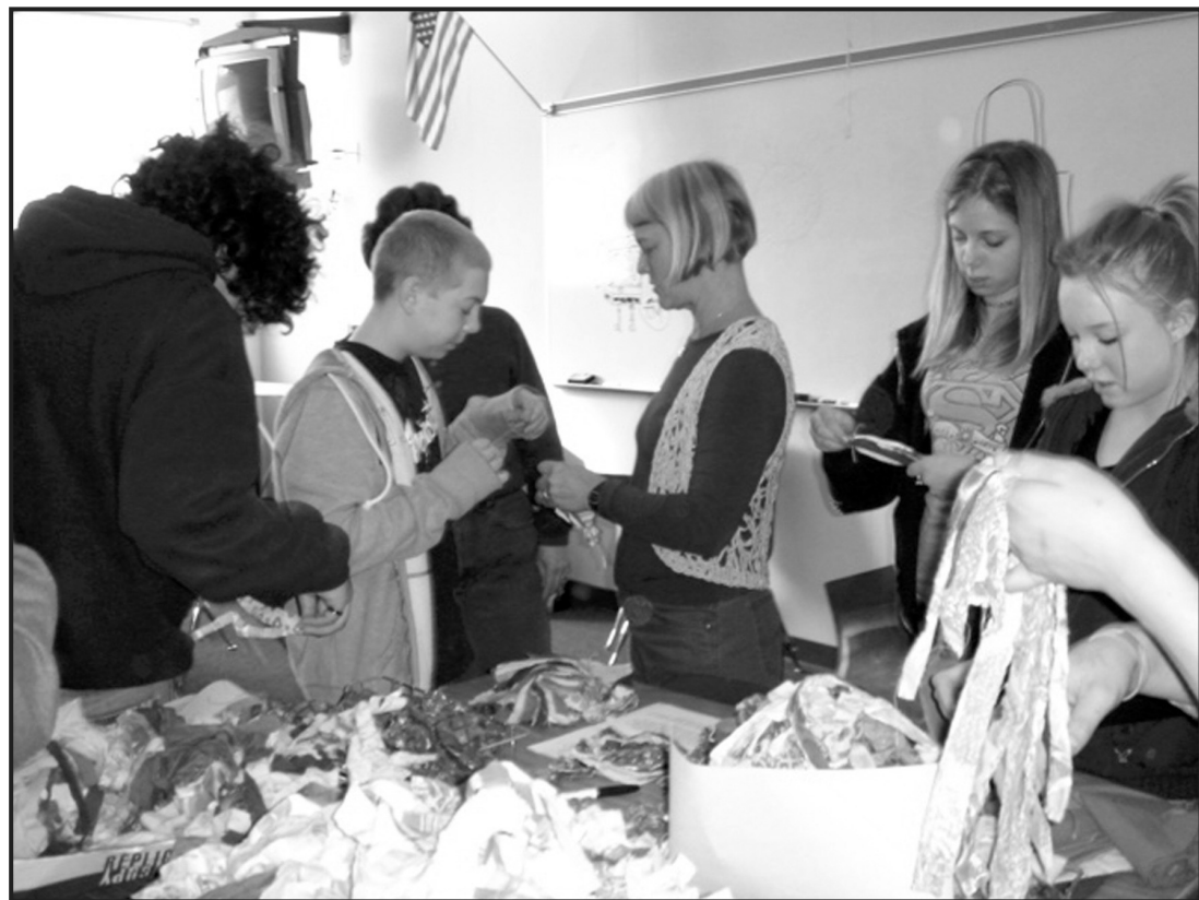
Making rag dolls was led by Illinois River Valley Arts Council volunteers.