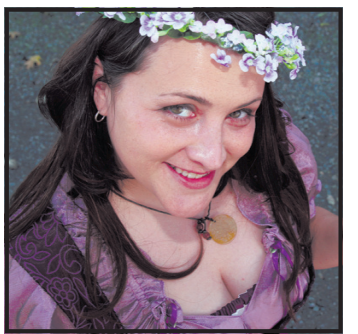
Halloween was observed by a number of businesses in Illinois Valley. (Clockwise from top, left) Illinois Valley News, Evergreen Federal Bank; Z Coffee; Evergreen Bank bear; IVN's Fun Fairy; Sterling Savings Bank; Cabin Chemistry; Clear Creek Family Practice; and Home Valley Bank.