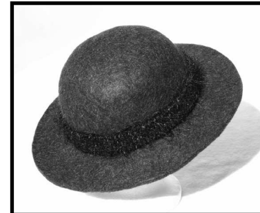
Dark brown Classic Dome With Black knit hatband.

The Collection goes on the Road November 15 to December 3 Select Your Hat Soon