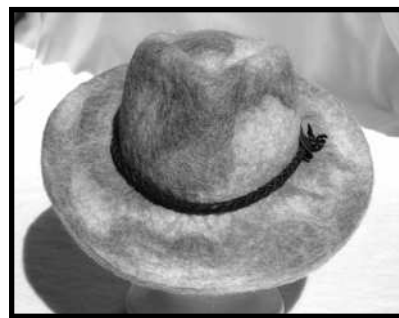
Fawn & cream marble Fedora with wide brim & leather band

We make one-of-a-kind llama felt hats for men & women Have You Tried One On?