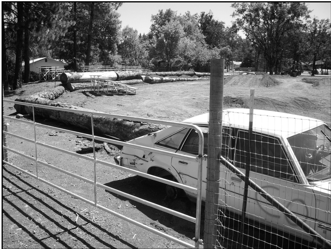
TOUGH TRUCKS and their drivers will go through their paces Saturday and Sunday, Sept. 1 and 2 beginning at 2 p.m. on the lot across from Jubilee Park. The Tough Truck event will be part of free activities (for spectators) as part of the Illinois Valley Lions Club Labor Day Festival at the park.