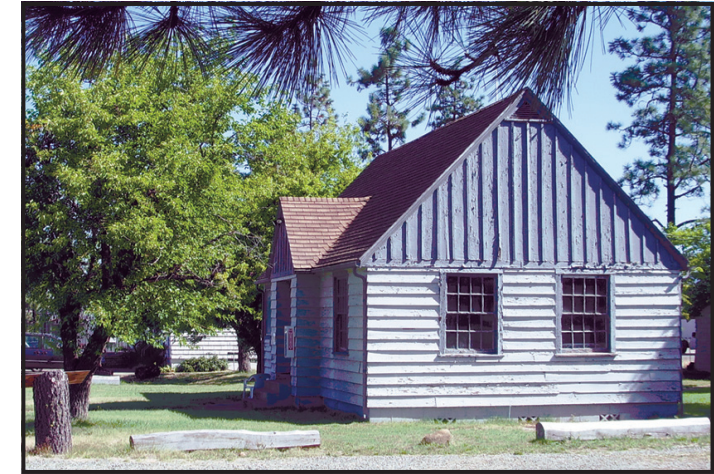
Former dispatch office would be part of the museum project at I.V. Airport.

Among major points that apparently need to be worked out: parking spaces, and credit for building and