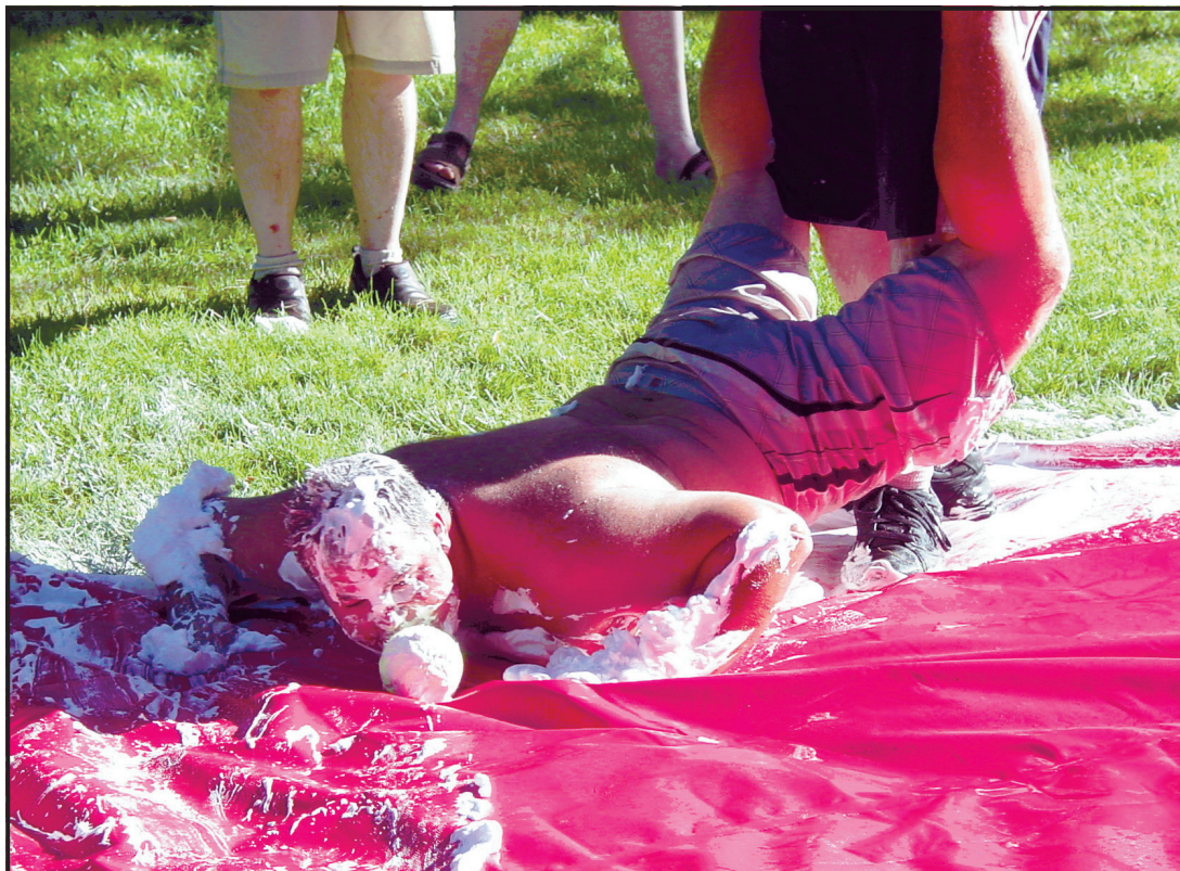
BELIEVE IT OR NOT, this shows an Illinois Valley Fire District (IVFD) volunteer 'having fun' at Rough & Ready Park on Saturday, Aug. 25. Volunteers and staff

"This is a newly formed group, and all community members are encouraged to attend, especially parents and business owners," noted a club spokesman.