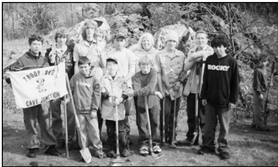
VOLUNTEERS DIG WORK - Numerous tree seedlings were planted at McCaleb Ranch Boy Scout Camp out Illinois River Road on Saturday, March 17. Forestry Action Committee led the annual riparian effort with help from members of Boy Scout Troop 880, I.V.