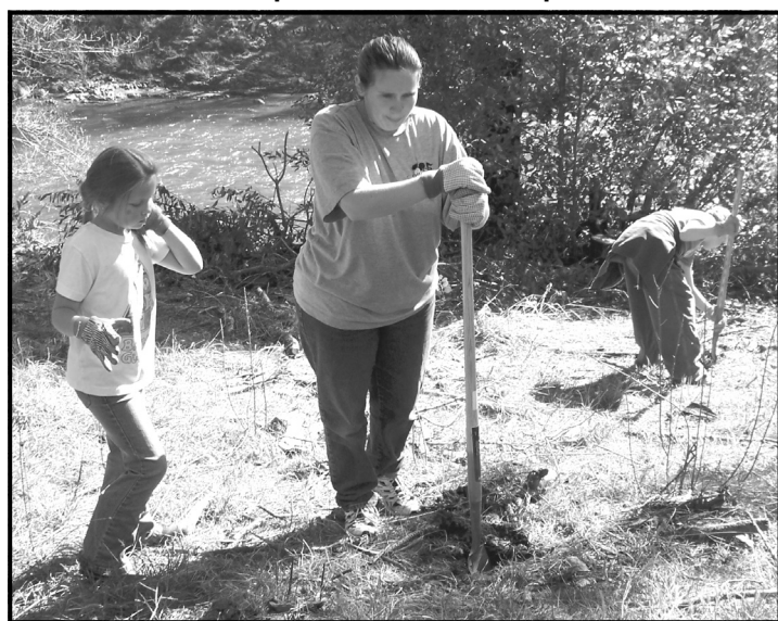
High School International Club, I.V. Section of the Boys & Girls Club, Brownie Troop 120, and Girl Scout Troop 123, who earned funds through the I.V. Soil & Water Conservation District. There also were a number of individual volunteers. Planted were Jeffrey and Ponderosa pines, Douglas Fir, Incense Cedar, Oregon Ash, Big Leaf Maple, Mock Orange, and Red Osier Dogwood. After planting, volunteers partook of a potluck meal in Cave Junction. (Photos provided)