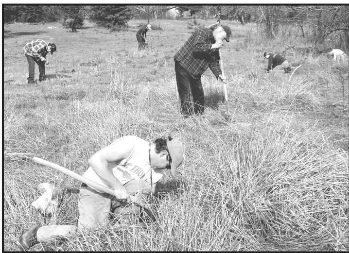
THE FORESTRY ACTION Committee's (FAC) 15th annual volunteer tree-planting day had two parts; March 10 and March 17. Community members placed seedlings at McCaleb Ranch Scout Camp and at riparian properties around the valley.