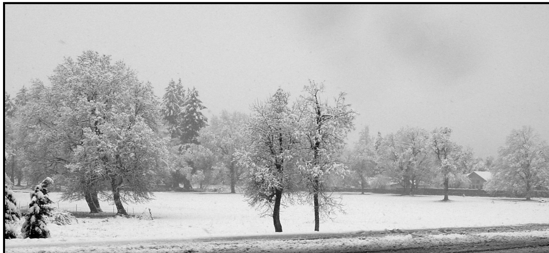
THE BIG NEWS this week turns out to be snow. So, here's another photo, in the event you hadn't noticed.