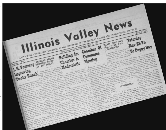
"I.V. News" Vol. 1, No. 1, May 13, 1937

If you like to dance, if you like good music, in short if you like a good time you will not want to miss the Legion dance Saturday.