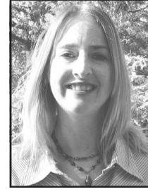
Multi-million dollar producer