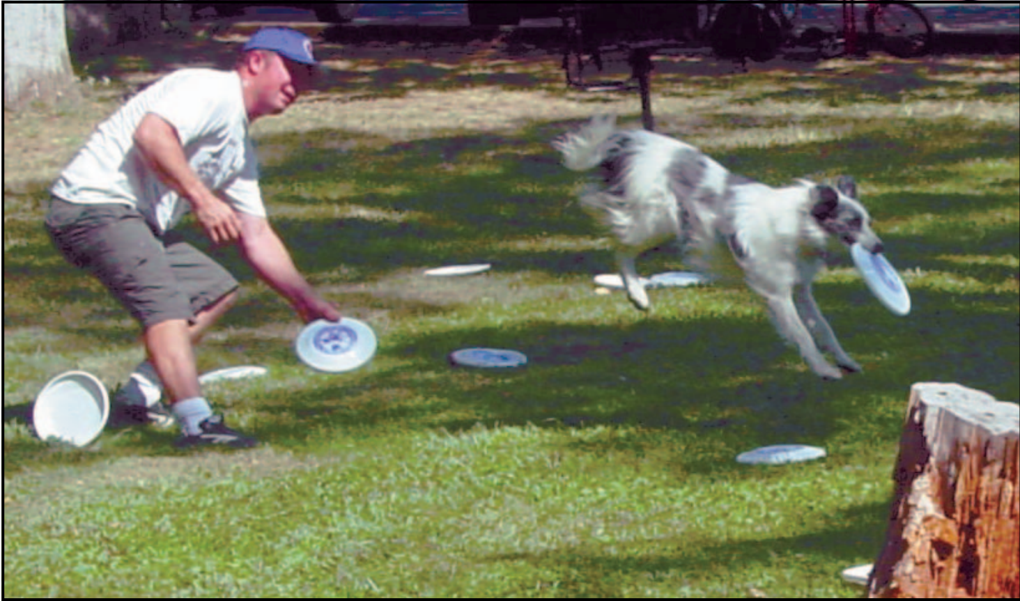
FLYING DOGS AND FRISBEES were the order of the day at Lake Selmac in Selma on Saturday, Aug. 19 with na-