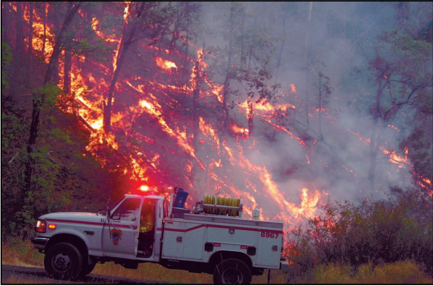
WHAT COULD HAVE BEEN a major wildfire was corralled quickly by Illinois Valley Fire District (IVFD) and Oregon Dept. of Forestry Saturday night, Aug. 19. Firefighters held it to approximately a half-acre of grass, brush and