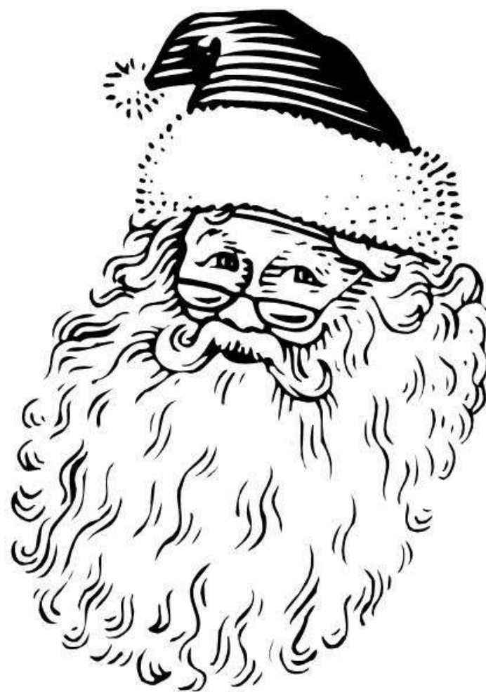
A RIGHT JOLLY OLD ELF