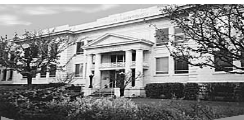
Issue 1 August 2005