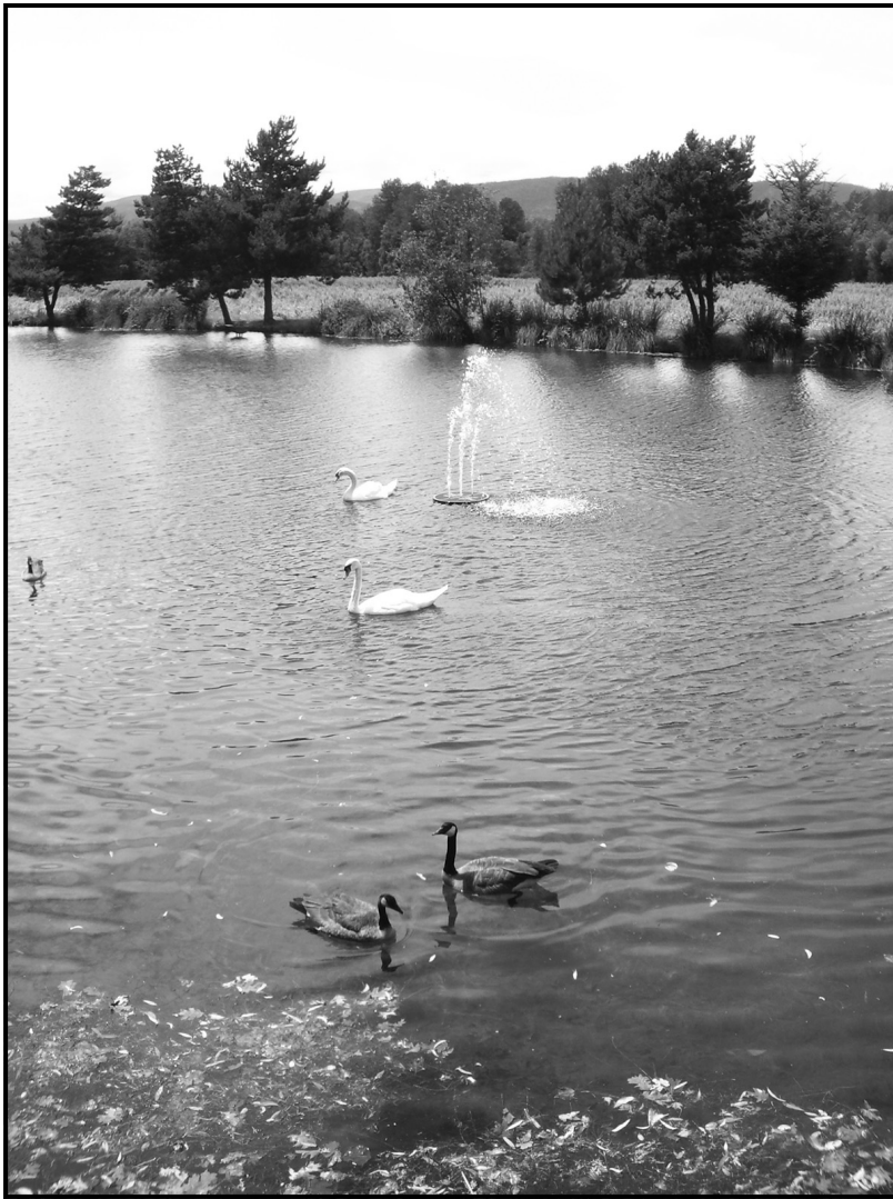
BRIDGEVIEW BEAUTY - Visitors to Bridgeview Vineyards Winery on Holland Loop usually find themselves admiring the large pond and its residents, which include swans and geese, not to mention rainbow trout and bull frogs. Besides wine-tasting and retail sales, the winery features a deck with seating available for parties with prior arrangement.

Place your ad in the valley's finest advertising medium and you will see results! Phone 592-2541. Deadline is 5 p.m. Thursdays.