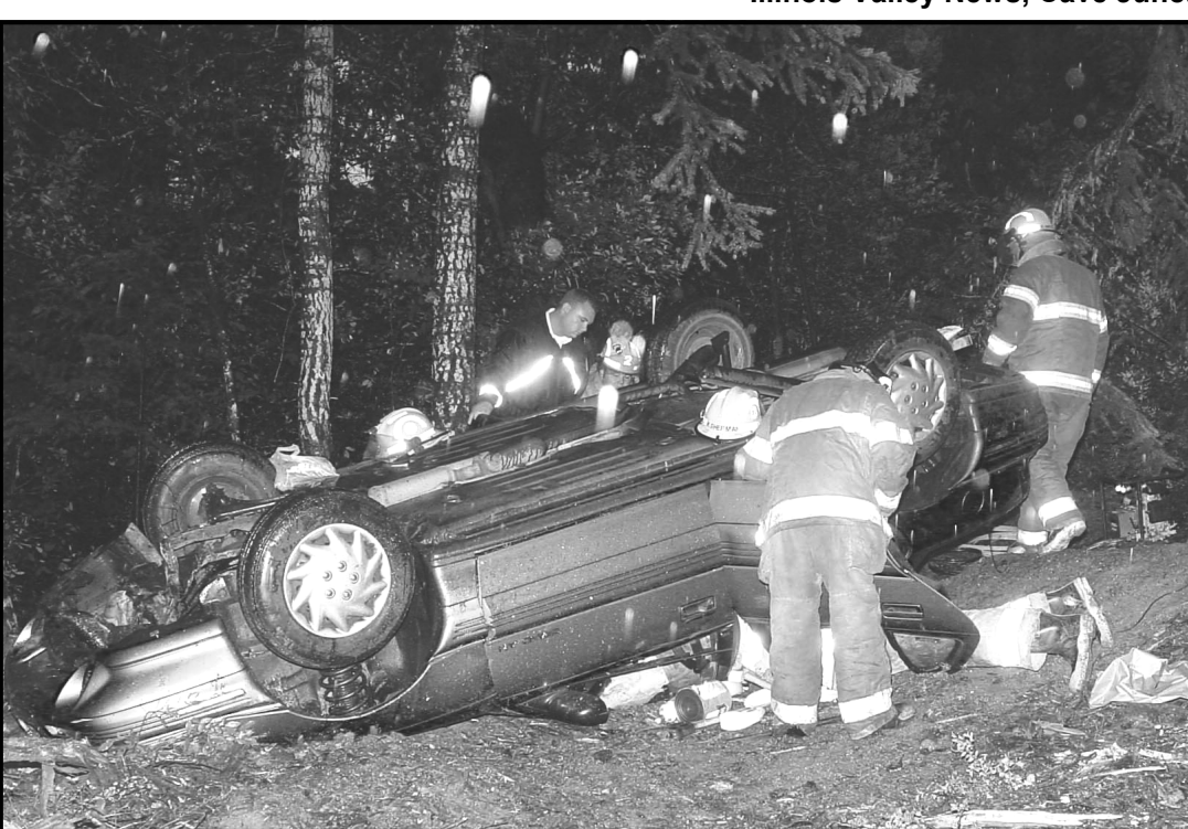
ROLLOVER IN SELMA - Illinois Valley emergency personnel responded shortly before 5:30 p.m. Sunday, March 20 to a single-vehicle crash in the 4300 block of Thompson Creek Road. Further information about the accident was unavailable in time for this issue.