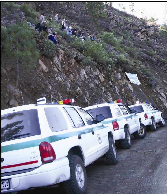
A crowd of protesters on a hillside above a roadblock cheers those being arrested. Numerous sheriff's deputies and forest service lawmen were on scene.

As part of the demonstration (Continued on page 7)