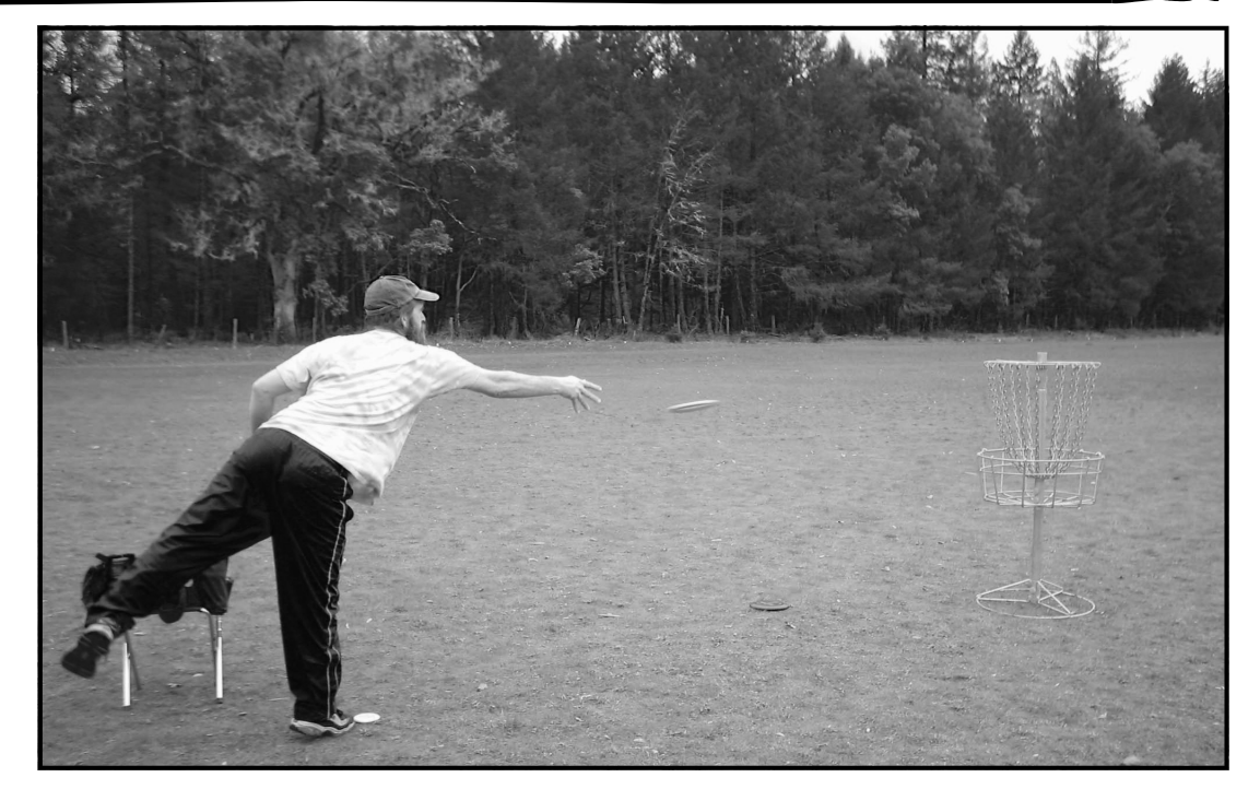
SELMAC DISC EVENT - 'Yoseman' from Canyonville was among approximately 50 participants Sunday, Feb. 27 at Lake Selmac in the Southern Oregon Winter Series competition. The event consisted of two 18-hole rounds. It was the premiere of the new course, which was completed by Josephine County Parks & Recreation Dept.

McDonald's fast-food restaurants have been operating in the Middle East and Africa since 1992. The success was especially evident when 15,000 customers lined up on opening day in 1994 in Kuwait City.